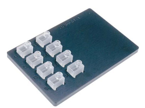
Figure 3. Bio-Cell™ Adapter with eight Bio-Cells. The Bio-Cell(s) are placed in wells corresponding to specific locations on a 96-well microplate and the adapter is placed in a microplate reader carrier. The reader can perform all of the functions with the Bio-Cell that it is capable of with microplate samples.

The Bio-Cell can also be utilized for purposes other than pathlength correction. Because the cell allows for vertical photometry with a fixed pathlength of 1 cm, the cell can be used for spectral scans or absorbance determinations of samples. These results can then be directly compared to values obtained using a conventional spectrophotometer and cuvettes because the light pathlengths are equivalent.